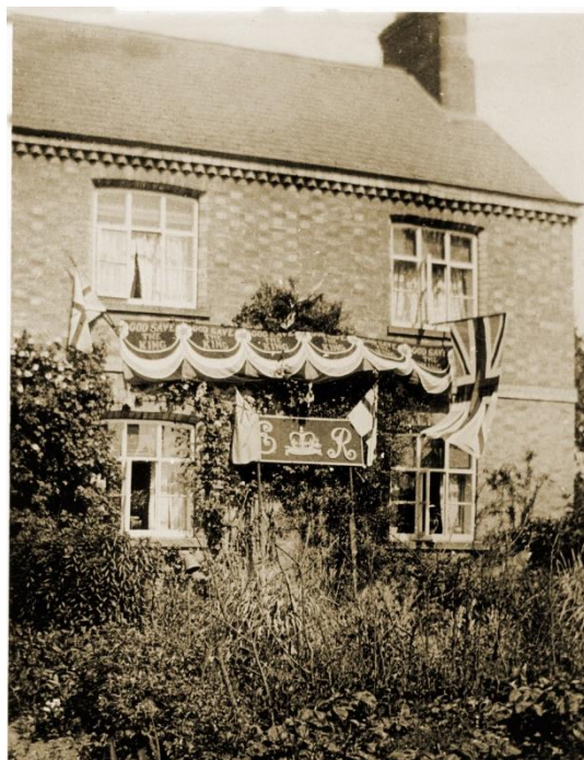
The old School House on School Lane in 1902, decorated for the coronation of Edward VIIth.